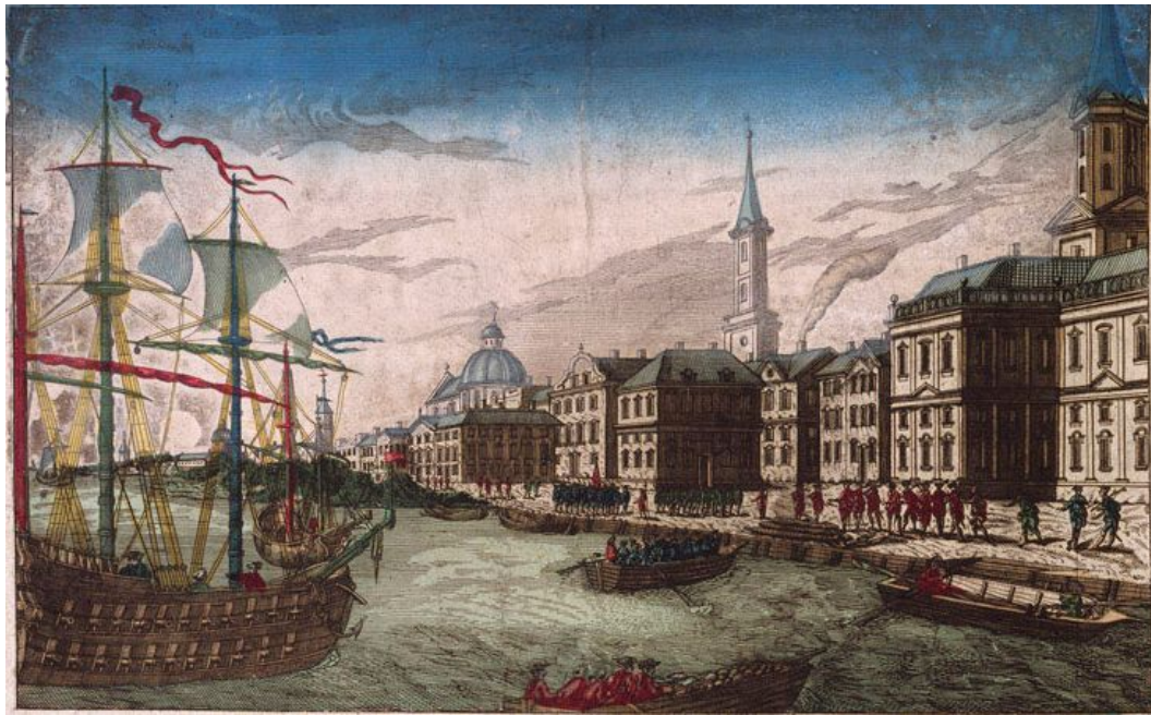
Landing of British troops in New York, 1776

In places like New York that were occupied by the British army, it was safer to be a Neutralist than a Patriot.